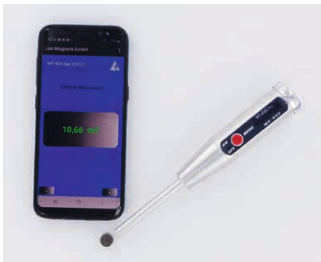
The MP-800 app records your Measurement (MP-800A / MP-800T)