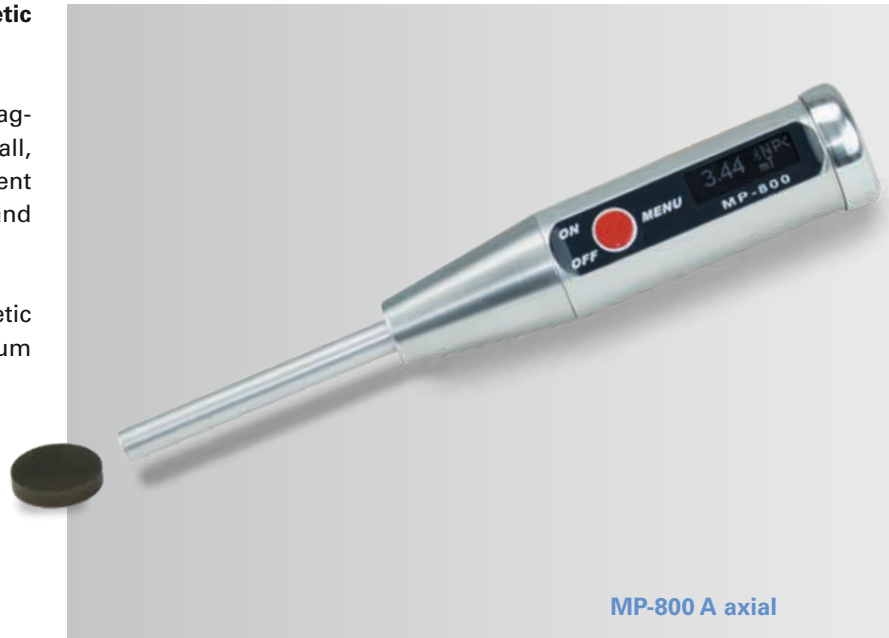
MP-800 A axial

To measure accurately all kinds of magnetic fields: AC fields, DC fields and maximum values in impulse fields.