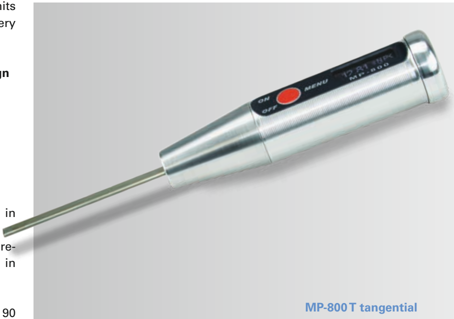
MP-800 T tangential

The tangential field probe measures in 90 degree angle to the probe axis particularly in air gaps, cavities and on the surface of workpieces, suitable for crack detection.