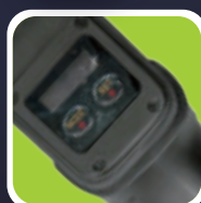
OLED Electronic Display Screen