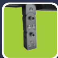
Adjustable Leg Spacing