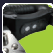
UV-A & White Light Source